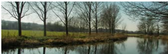
http://creativecommons.org/licenses/by/2.5/ Nick Robinson, 2008